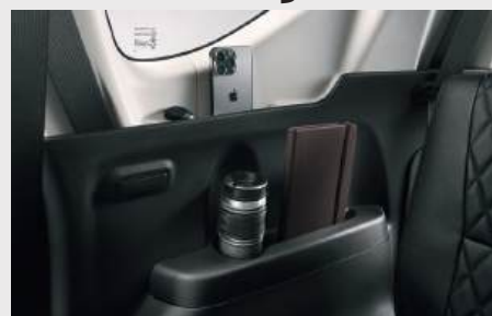
3rd Row Side Pocket & Cup-holder