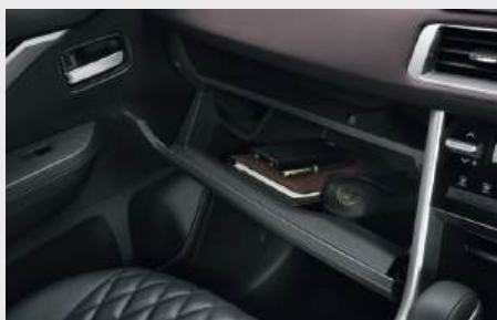
Glove Box with Double Compartment