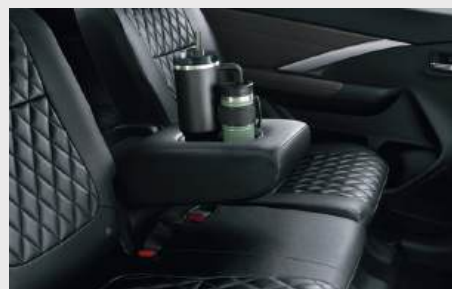
[NEW] 2 nd Row Arm Rest with Cup Holder