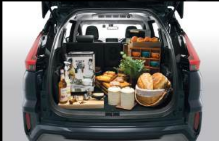
3 rd Row Seat Fold Flat & 2 nd Row Seat Half up