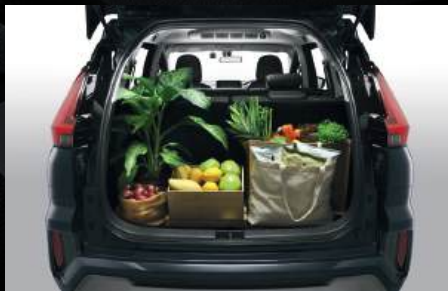
2 nd & 3 rd Row Seat up