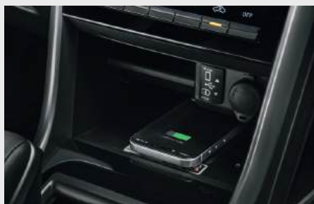
Front Console Tray with Card Holder & Storage