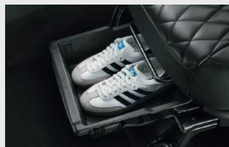
Underseat Multi-purpose Storage