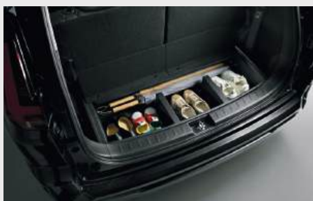
Cargo Floor Box with Lid

Visuals shown are for illustration purposes only. Specifications may vary according to variant/market. Please consult your local Mitsubishi Motors dealer for more information.