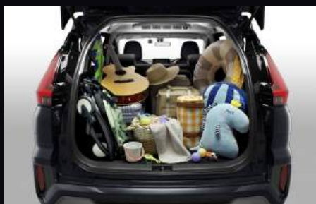
3 rd Row Seat Fold Flat