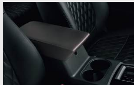
[NEW] Leatherette Center Console Arm Rest