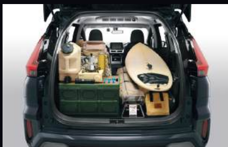
2 nd & 3 rd Row Seat Fold Flat